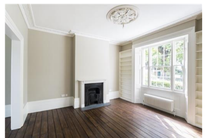
Restored reception room