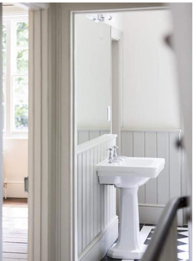
Restored bathroom and landing