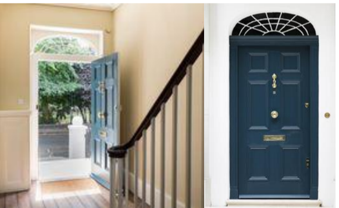
The burnt door, fanlight, porch and steps were replaced