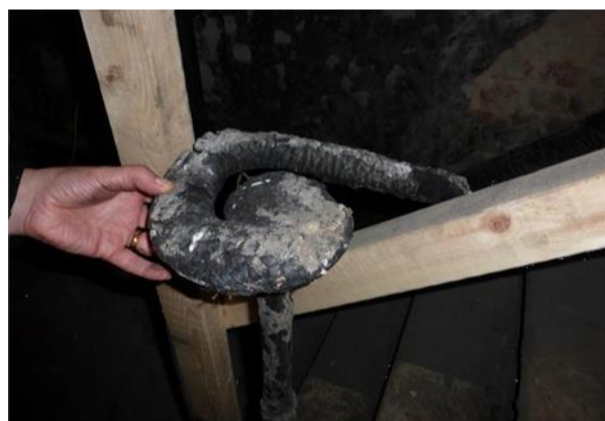
Staircase was restored