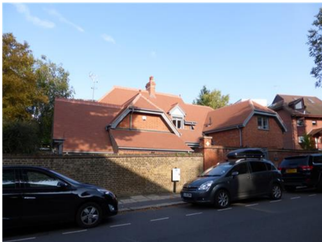
L to R: Retained wing, rebuilt wing, extension