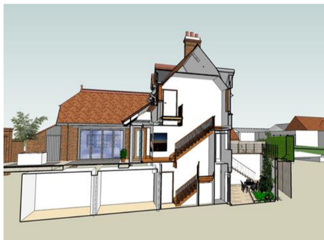
Section illustrating basement and lightwell