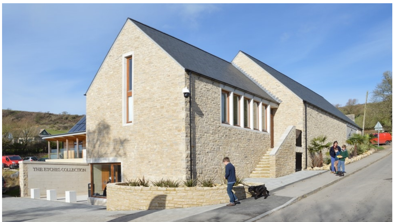
The building is faced in Purbeck stone from a nearby quarry, to complement the village setting