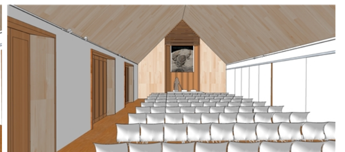
Clore Learning Centre as lecture theatre