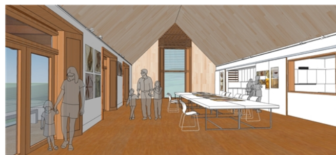
Clore Learning Centre as education space