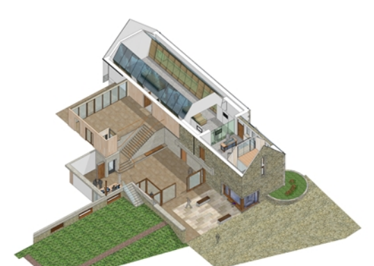
Cut-away lower ground floor