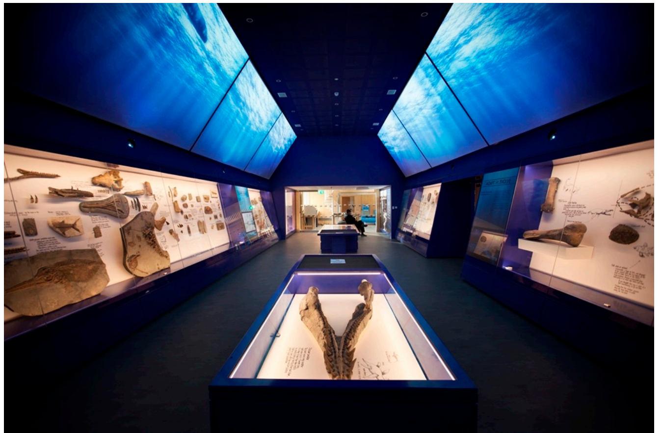
The fossil gallery - The collection is displayed in cases with interactive touch screens. CGIs of the extinct marine creatures are projected on screens to simulate a Jurassic sea. The gallery has a glass wall to allow a full view of the collector's workshop